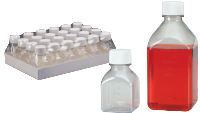
125 & 500 mL Bottles