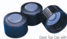
Open Top Cap with Septa