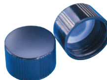
Solid Top Cap with Liner